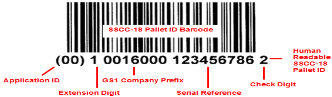
Figure 1. Pallet or tote label with SSCC-18 unique pallet identifier