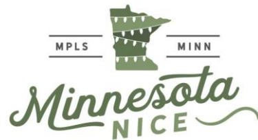
Brave New Workshop