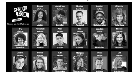
The Gender Cool Project

June 2020 Expanding our Understanding of Gender Identity